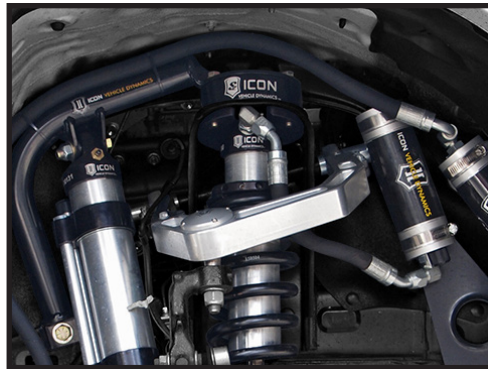
[TECH NOTE #2]

RETORQUE ALL NUTS, BOLTS AND LUGS AFTER 100 MILES AND PERIODICALLY THEREAFTER.