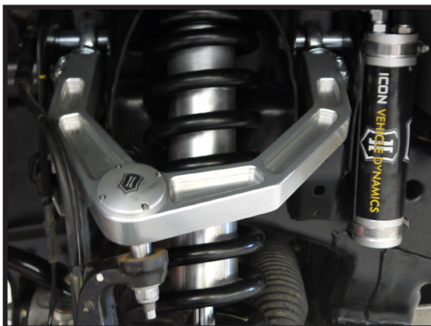
[PASSENGER SIDE SHOWN]