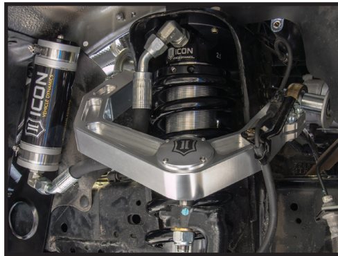
[TECH NOTE #2]

RETORQUE ALL NUTS, BOLTS AND LUGS AFTER 100 MILES AND PERIODICALLY THEREAFTER.